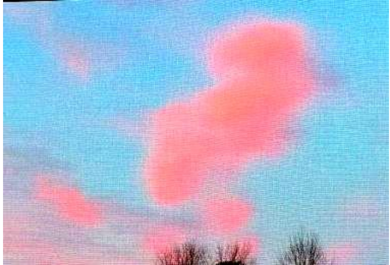
"Barbie" pink clouds at dawn