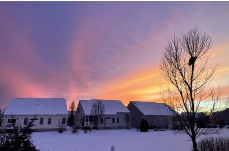
Dawn at the VOLC