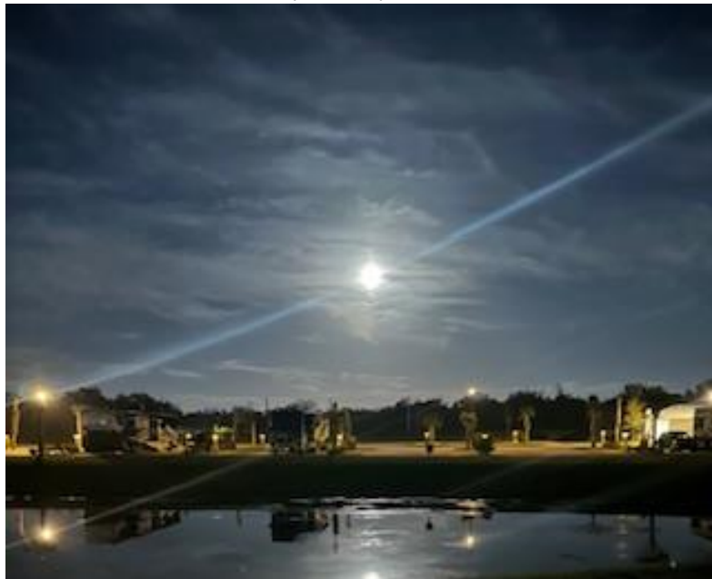
Moon setting at 6:30 AM.