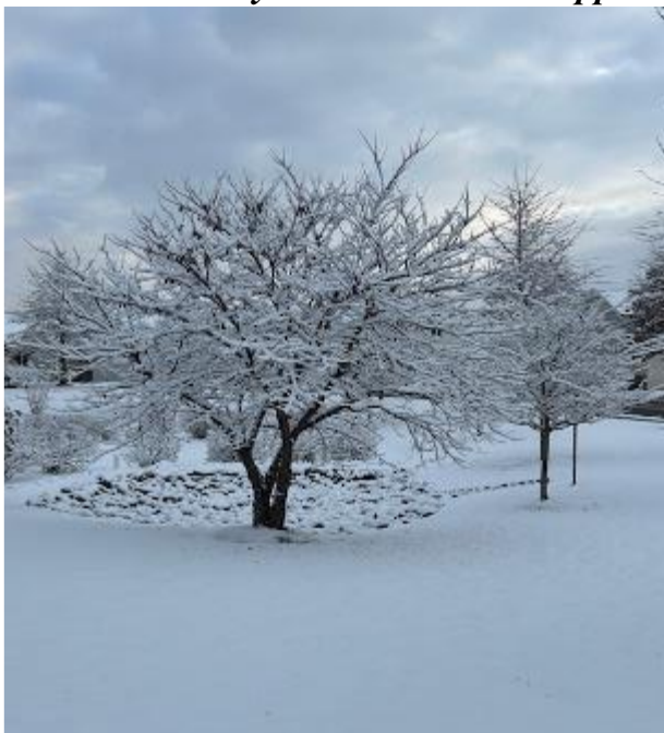
Left - February snow