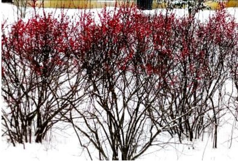
Berries in the snow